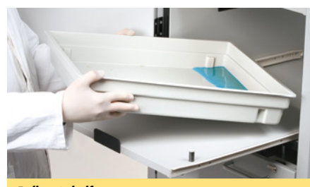
Pull-out shelf Sturdy construction with removable plastic sump

Multistage, high-capacity and robust broad band-pass filter, environmentally friendly due to long service lifetimes and filter recycling