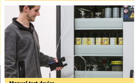
Manual test device Easy monitoring of the filter saturation when storing inorganic substances

Easy operation Monitoring electronics with state-of-the-art 4.7" graphic display incl. touch panel, displays all essential monitoring-details